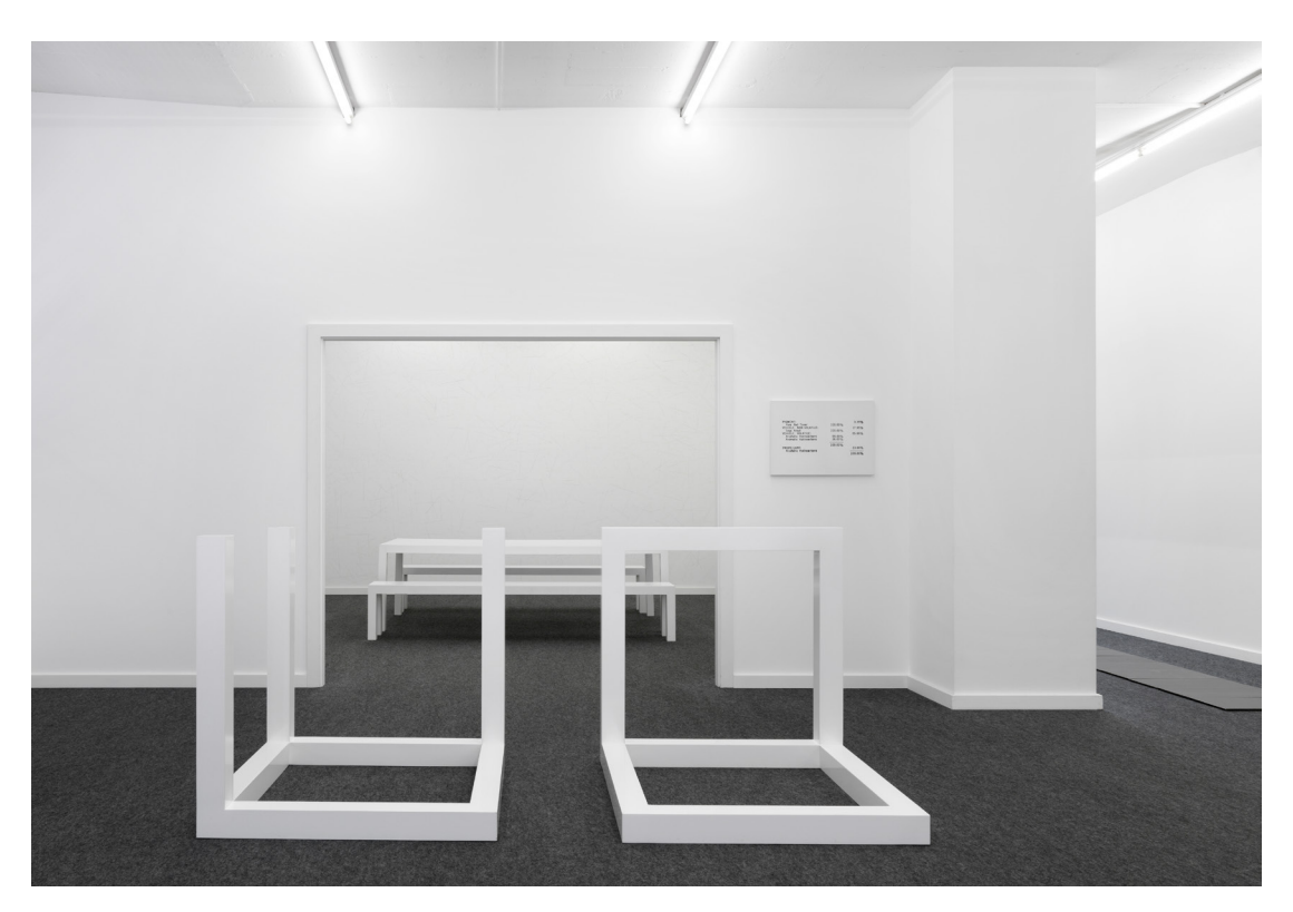
Exhibition view of L'Appartement